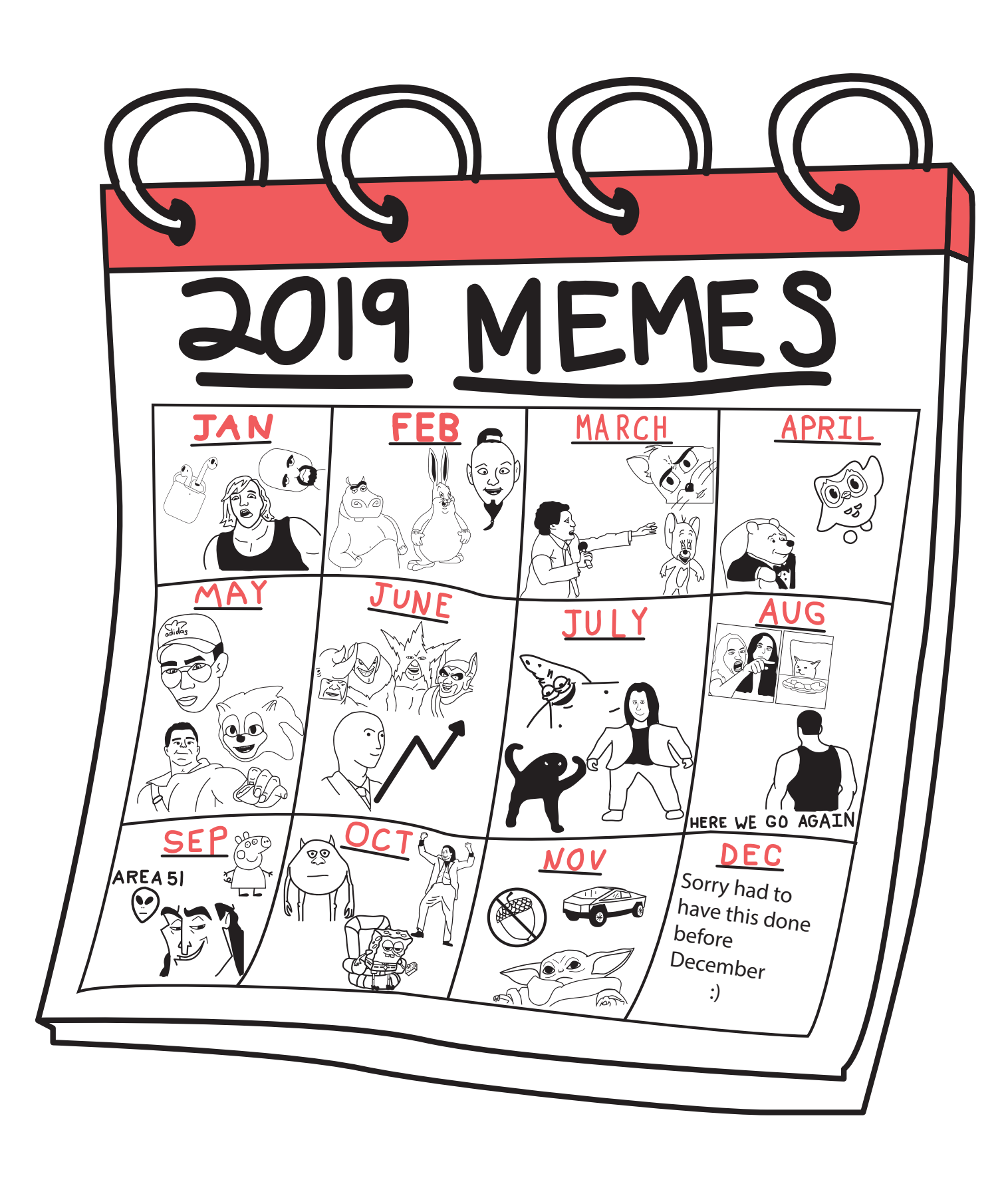
Illustration of the 2019 Memes for the comic of the December issue. It encopases the most popular meme during the months of 2019.