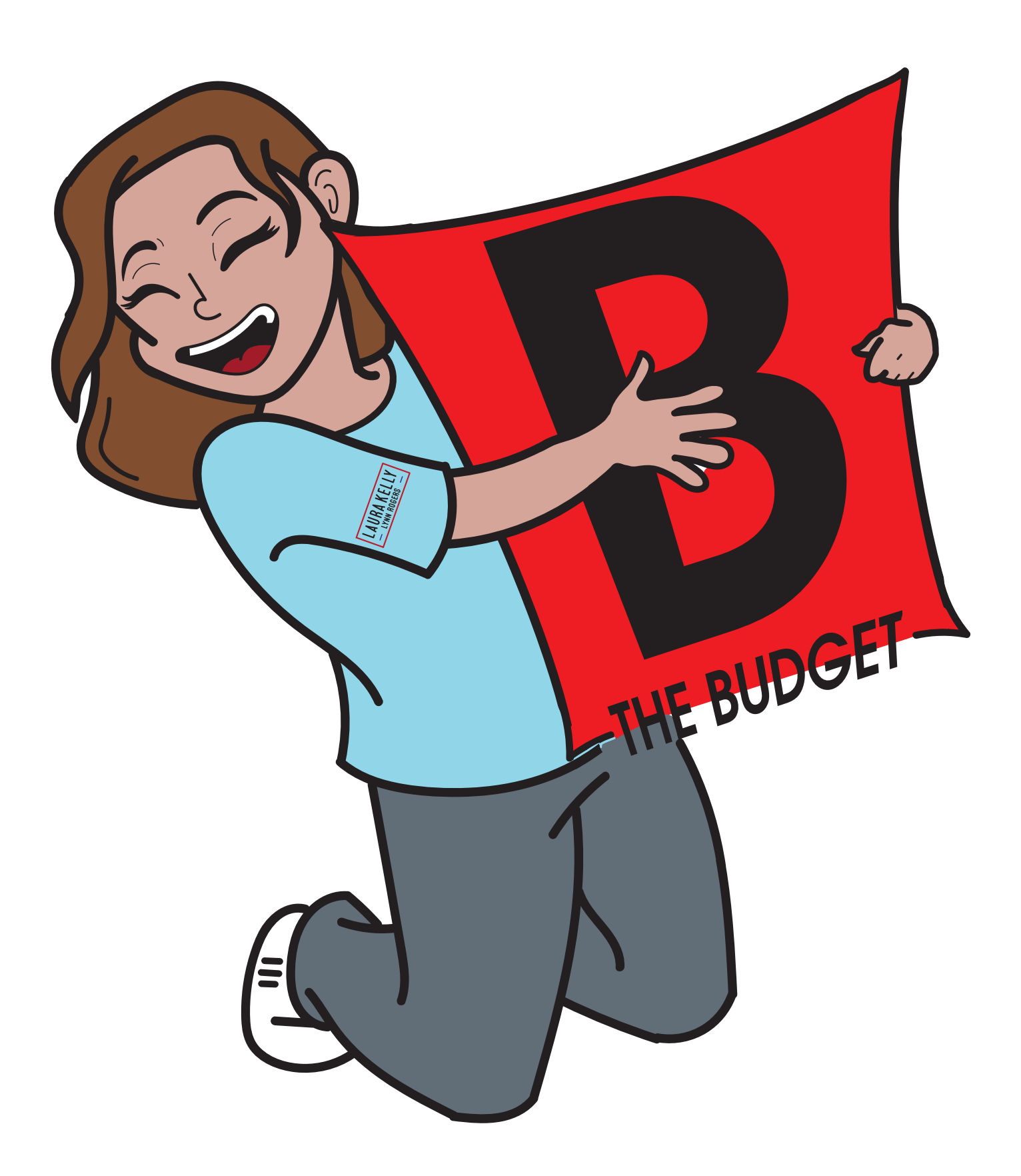
Illustration of our senior editor and chief saying her goodbyes to the publication. Used in our senior issue, that was mailed to all attending students at Lawrence High School.