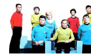
Survey conducted through Facebook poll with 163 respondents.