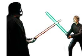
star wars photo from wikimedia commons star trek photo from pixy.org