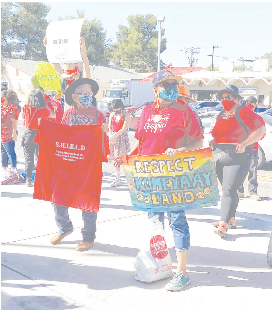
JULIA WOOCK / STAFF