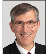
Peter Marks, M.D., Ph. D Center for Biologics Evaluation and Research

In a press conference exclusively for student journalists across the country, acting FDA Commissioner Janet Woodcock and Peter Marks of the Center for Biologics Evaluation and Research answered questions about the Pfizer-BioNTech COVID-19 vaccine.