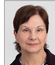
Janet Woodcock, M.D. Acting FDA Commissioner