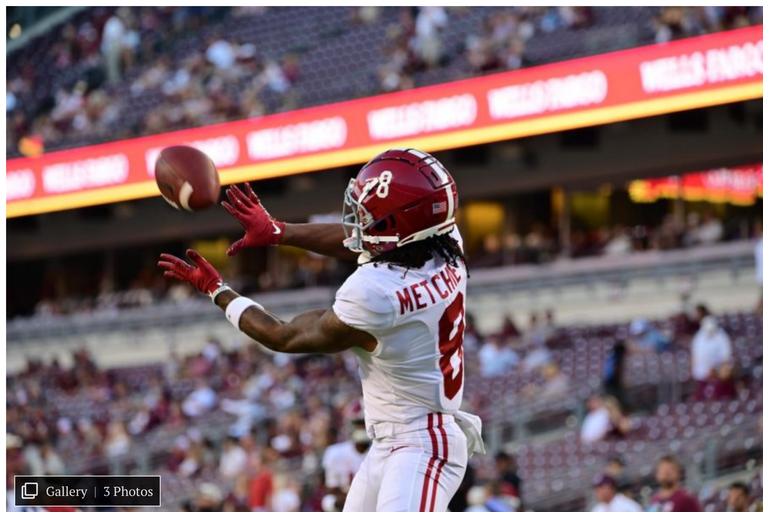
Gallery | 3 Photos