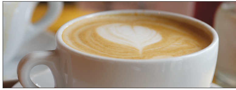
Cup of Joe Find coffee shops close to campus, Page 9