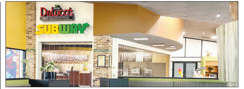
Subway Food and snack options on campus scarce, Page 3