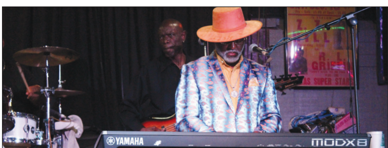
Dallas Blues A music genre rooted in Deep Ellum, Pages 4-5