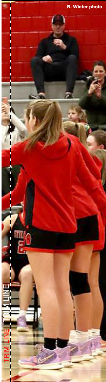
B. Winter photo