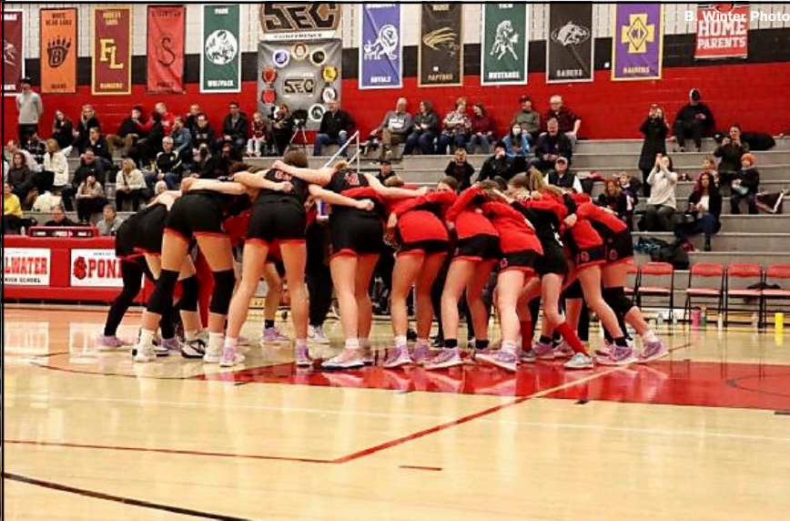
B. Winter Photo