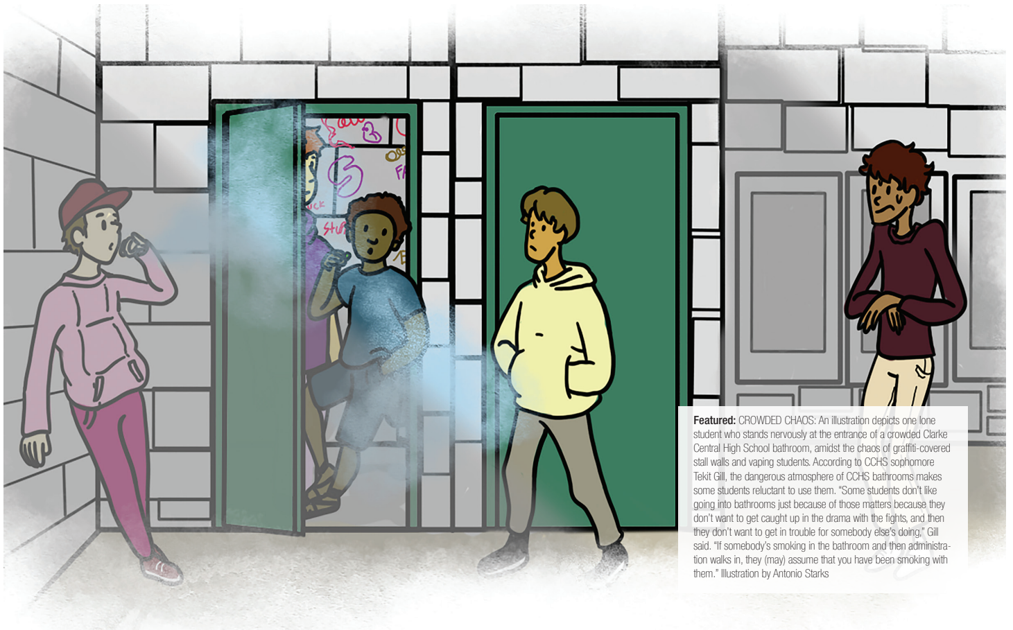
Featured: CROWDED CHAOS: An illustration depicts one lone student who stands nervously at the entrance of a crowded Clarke Central High School bathroom, amidst the chaos of graffiti-covered stall walls and vaping students. According to CCHS sophomore Tekit Gill, the dangerous atmosphere of CCHS bathrooms makes some students reluctant to use them. "Some students don't like going into bathrooms just because of those matters because they don't want to get caught up in the drama with the fights, and then they don't want to get in trouble for somebody else's doing," Gill said. "If somebody's smoking in the bathroom and then administration walks in, they (may) assume that you have been smoking with them." Illustration by Antonio Starks