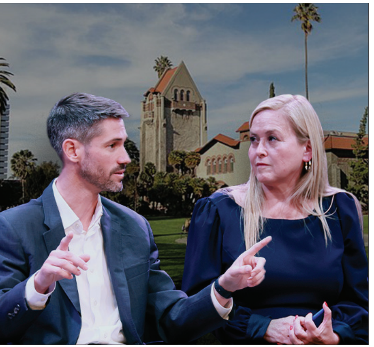
PHOTO ILLUSTRATION BY BRYANNA BARTLETT; SOURCE: SPARTAN DAILY ARCHIVES

After the Q&A, Chavez and Mahan were remarks.