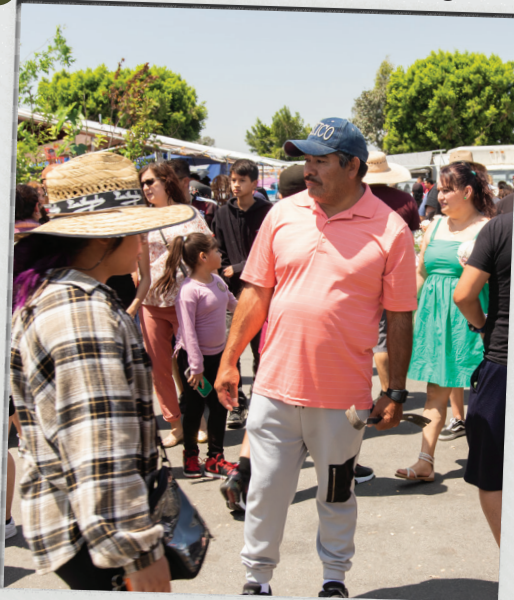
OPEN AIR/ Crowds walk through rows of vendors with easy-ups for shade in hot sun