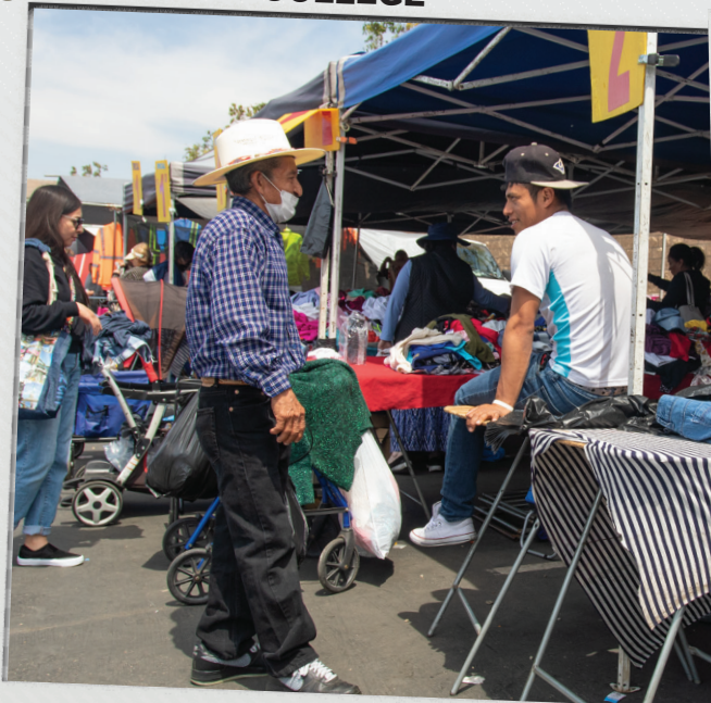
COMMUNITY/ Familiar faces blossom friendships as people browse through two dollar clothing tables