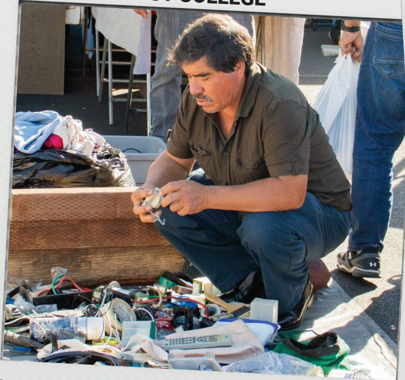
DIG IN/ Many vendors lay out their items on a tarp for customers to look through themselves and ask for prices