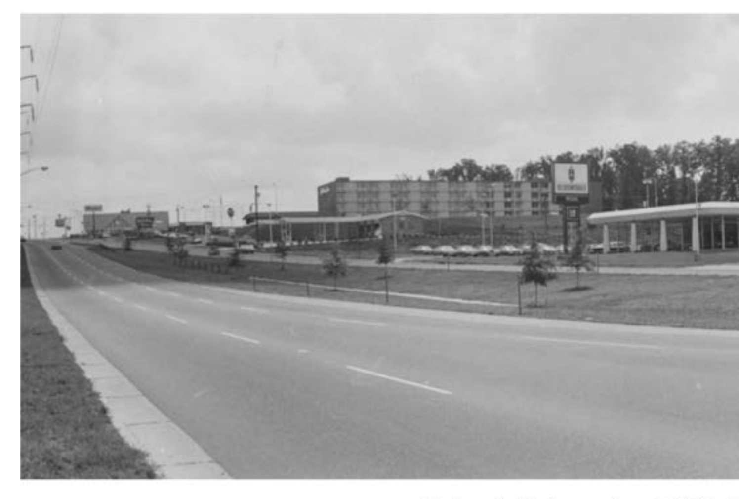
University Parkway, August 1971, Fi image courtesy of the Forsyth County Publi