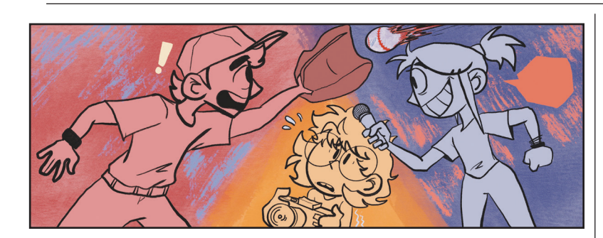
Athletes Q&A Get to know Brookhaven baseball and soccer players, Page 6