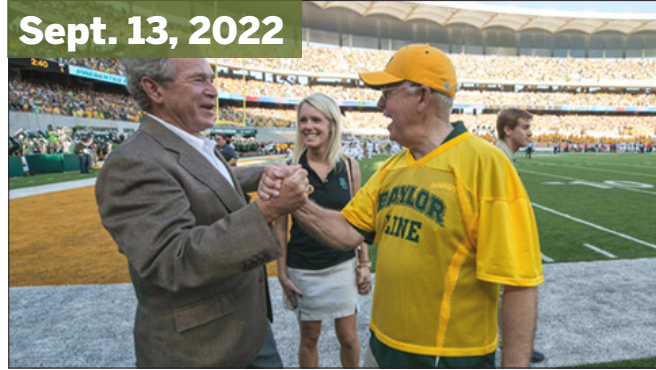
Sept. 13, 2022

All of these stories can be read in their entirety at baylorlariat.com .