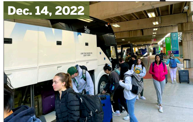
Dec. 14, 2022

After months of summer renovations, the Moody Memorial Library Starbucks and Bill Daniel Student Center Chick-fil-A reopened in August 2022 with expanded menus and mobile ordering services. Both restaurants underwent these renovations as part of contractual scheduled renovation period and licensing agreements.