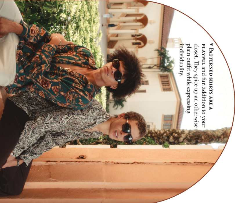
▶ PATTERNED SHIRTS ARE A PLAYFUL and fun addition to your closet. They spice up an otherwise plain outfit while expressing individuality.

Many luxury brands are a prominent source of inspiration for the budding feminine male fashion movement. More and more celebrities have been rocking feminine Gucci looks since actor Jared Leto starred in the 2021 film "House of Gucci." Since the '80s, Gucci has often played around with mens fashion. The fall 1995 ready-to-wear line included fitted velvet mens suits that did not shy away from color, and other shows throughout the decade