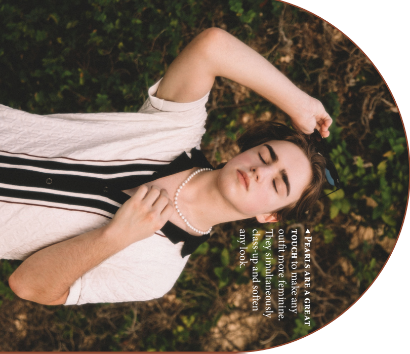
▶ PEARLS ARE A GREAT TOUCH to make any outfit more feminine. They simultaneously class-up and soften any look.

words_victoria_fondeur. design_lizzite_kristal.