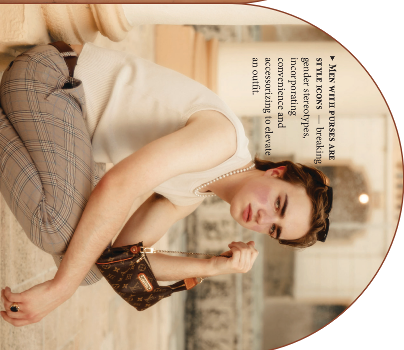
▶ MEN WITH PURSES ARE STYLE ICONS — breaking gender stereotypes, incorporating convenience and accessorizing to elevate an outfit.

"I think it is not a particular piece of clothing but the