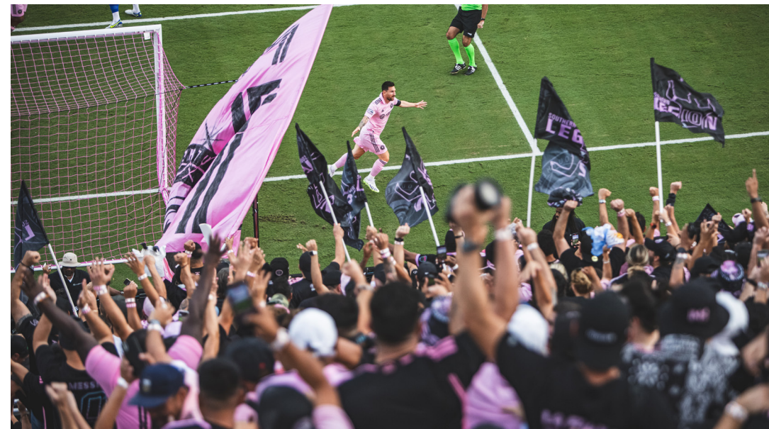
Lionel Messi celebrates his goal as fans cheer him on at DRV PNK Stadium on July 25, 2023