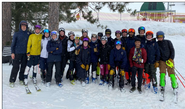
TAKE A BREATHER. The alpine team takes a moment to relax on the slopes after a long practice. With winter daylight hours much shorter than other sports seasons, many alpine practices go well after sunset. Thankfully, local ski hills like Buck Hill and Hyland Hills are equipped with large spotlights to illuminate the slopes below.