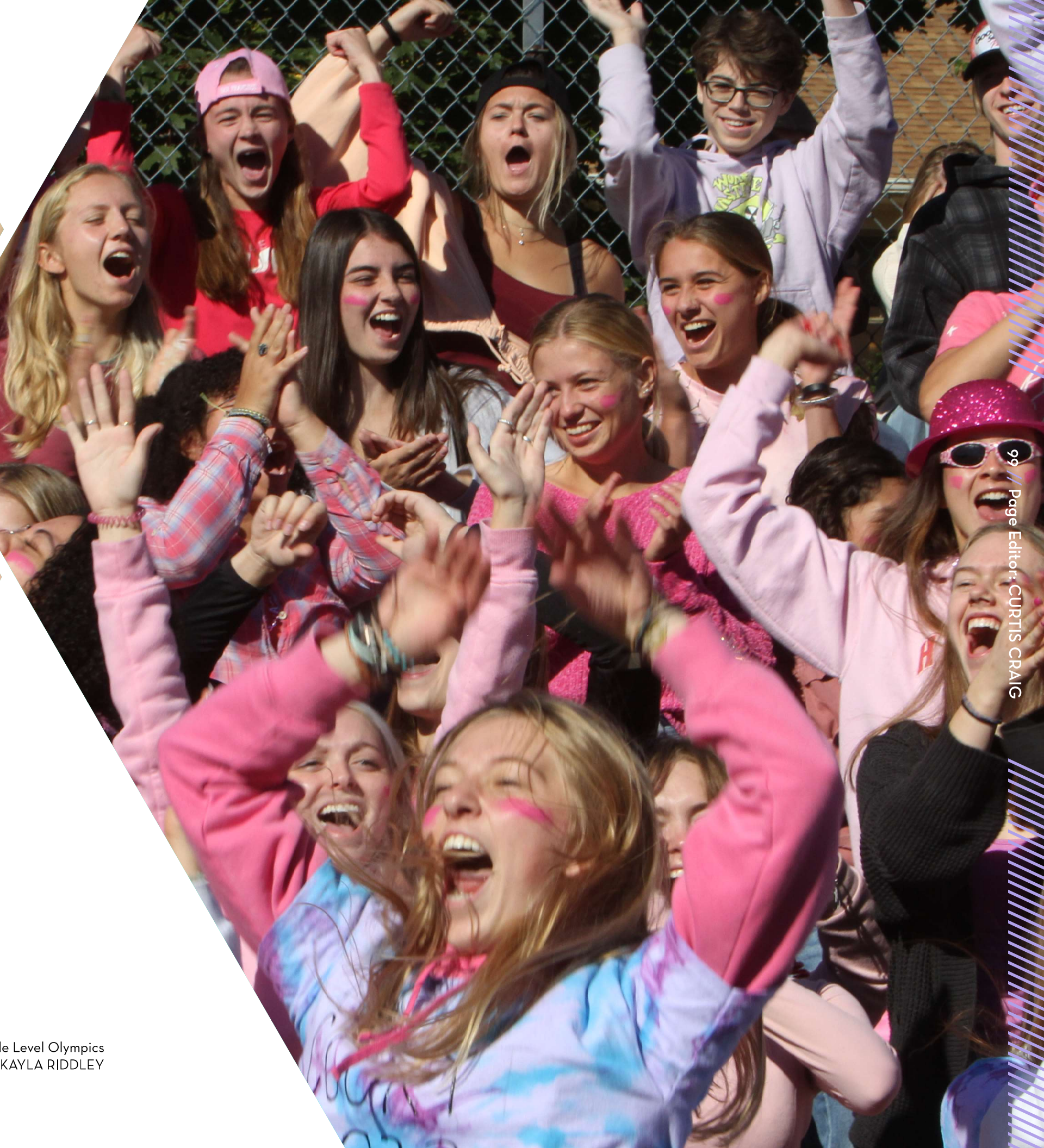
99 // Page Editor: CURTIS CRAIG