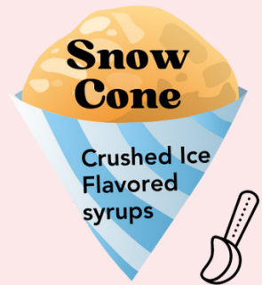
Data from Masterclass.com and Kitchenaid.com