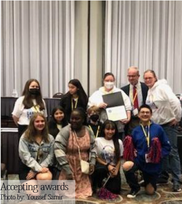
Accepting awards