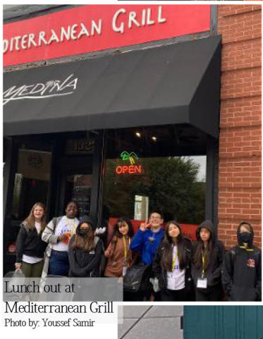
Lunch out at Mediterranean Grill