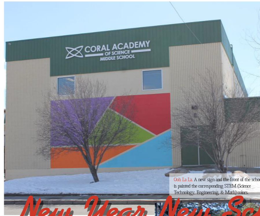
Ooh La La. A new sign and the front of the school is painted the corresponding STEM (Science Technology, Engineering, & Math) colors.