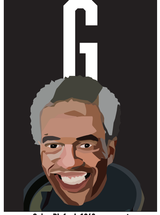
Guion Bluford, 1942 — present Bluford became the first African American in space after the STS-8 mission launched its crew in 1983. He spent over 28 days in space across