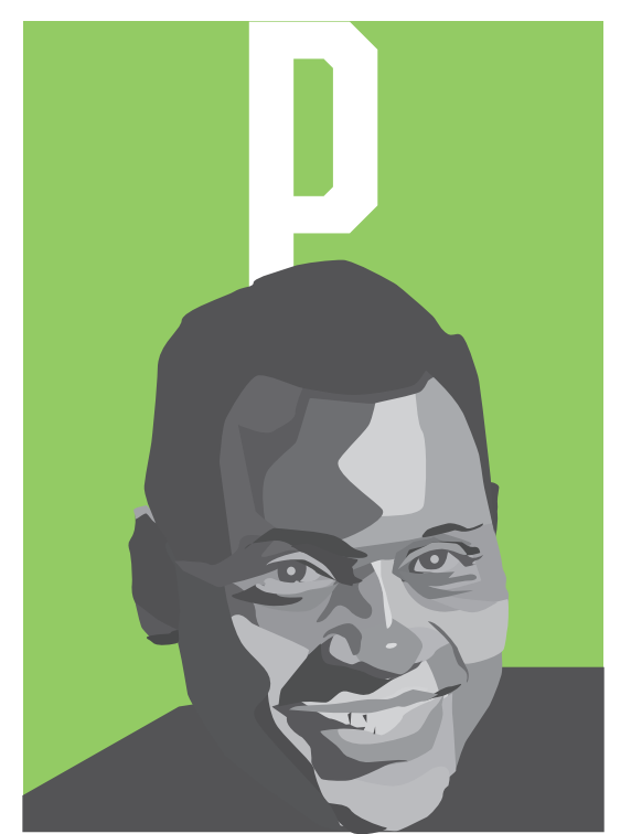
Paul Robeson, 1898 — 1976 Robeson was one of the first Black men to hold serious theater roles. His Othello was the longest-running Shakespeare play in