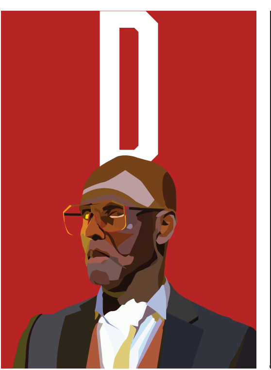
Dapper Dan, 1944 — present A fashion designer from Harlem, New York, Dapper Dan pioneered "logomania," a style incorporating popular brand symbols.