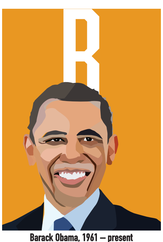
Obama was elected as the first African American president in 2008 and was the fourth president to win a Nobel Peace Prize.