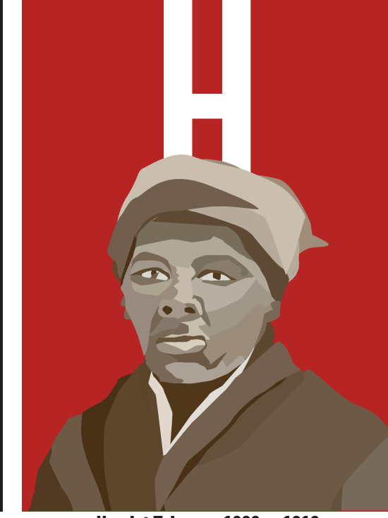
Harriet Tubman , 1822 — 1913 Born to slavery, Tubman used skills she learned about secret African American communication networks to aid escapes through the Underground Railroad.