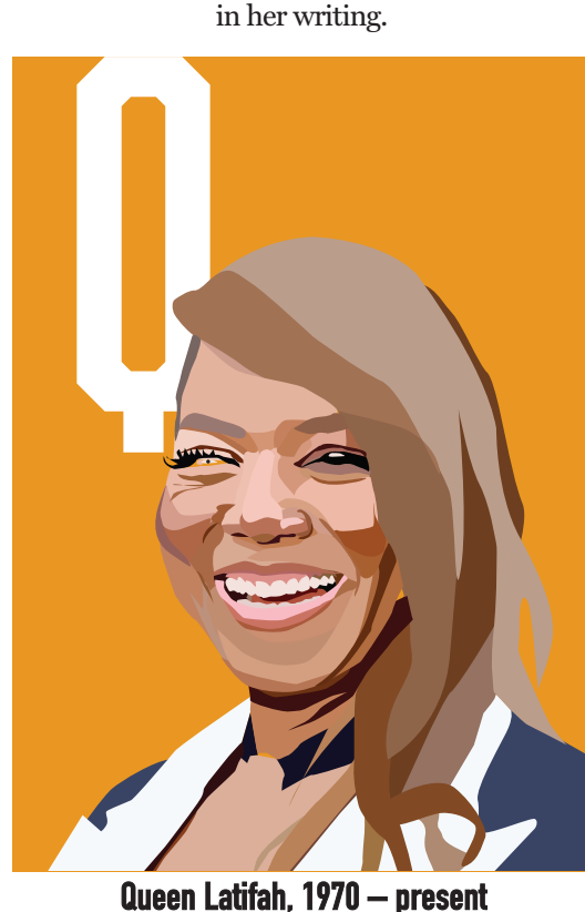
In 1989, Queen Latifah released one of the first feminist hip-hop albums at that time. In a male-dominated genre, she's carved out a feminist niche.