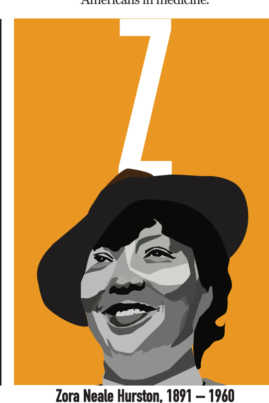
Hurston was a world-renowned writer and anthropologist. Her novels, short stories and plays often depicted African American life in the South.

Widely known for her role in "Heartstopper," Finney often speaks about her identity as a Black, British transgender woman in the spokesman for the Nation of Islam during the acting industry.