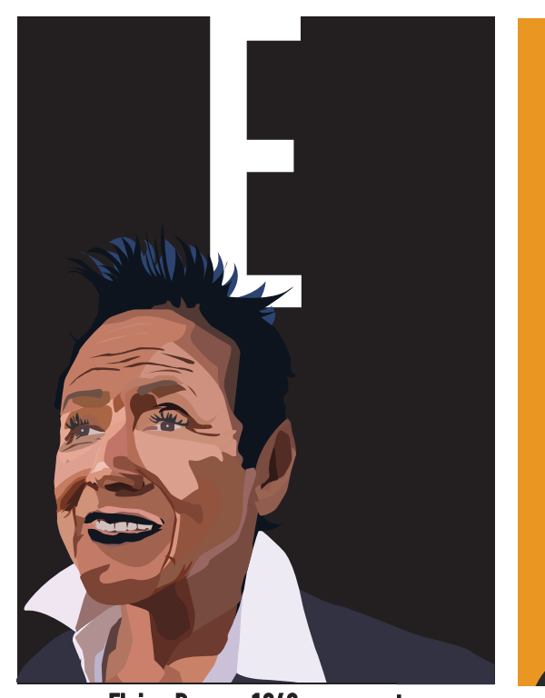
Elaine Brown, 1943 — present As an activist, Brown's efforts extend to prison reform and providing educational resources for African American children in poverty.