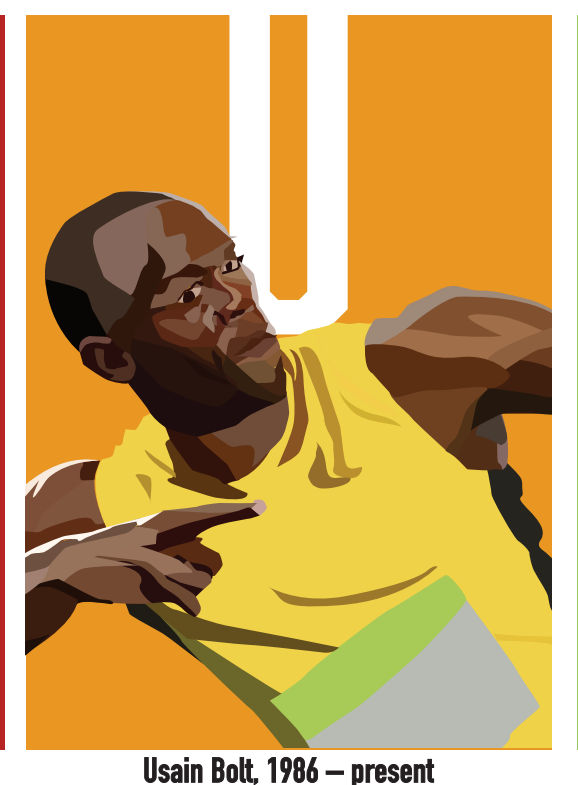
The "fastest man in the world," Bolt secured and broke world records in the men's 100-meter and 200-meter sprints in the Beijing 2008 Olympic Games.