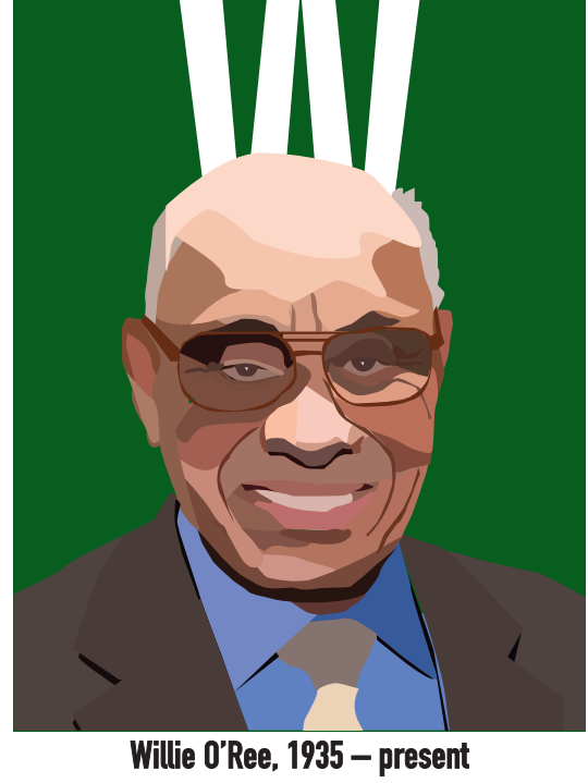
Canadian-born O'Ree was the first Black player in the National Hockey League, debuting with the Boston Bruins against the Montreal Canadiens in 1958.