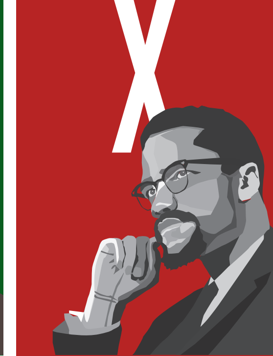
Malcolm X, 1925 — 1965 Malcolm X was a minister, civil rights activist and prominent Black leader who served as a