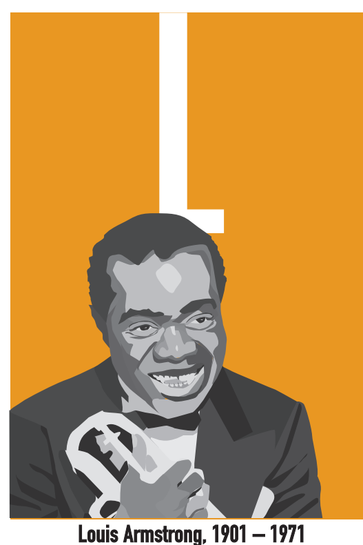
Armstrong dropped out of school to begin working, eventually saving enough to buy his first cornet and setting his sights on becoming a professional musician.