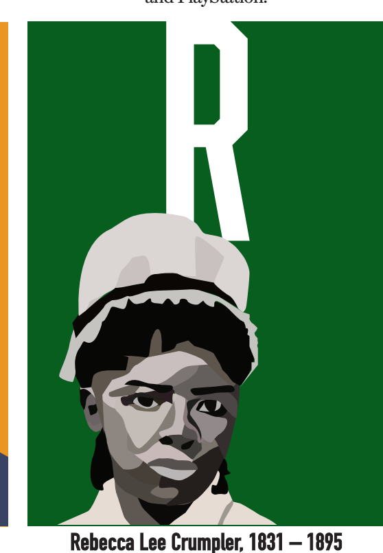
Dr. Crumpler was the first Black woman to earn a medical degree in the U.S., battling the prejudice against women and African Americans in medicine.