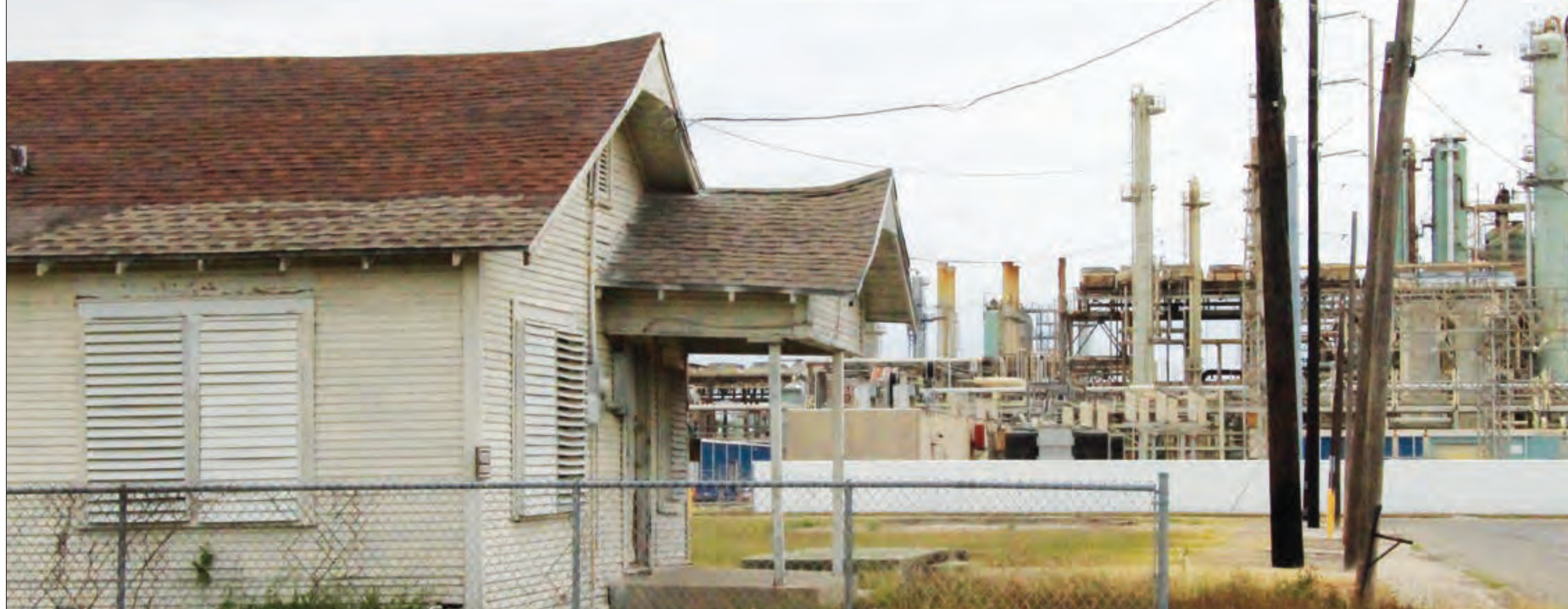
A Minton Street house sits in front of a Flint Hills Resources refinery. Corpus Christi's Hillcrest neighborhood has become populated by many refineries like it, which many have argued has led to negative health effects for the community.