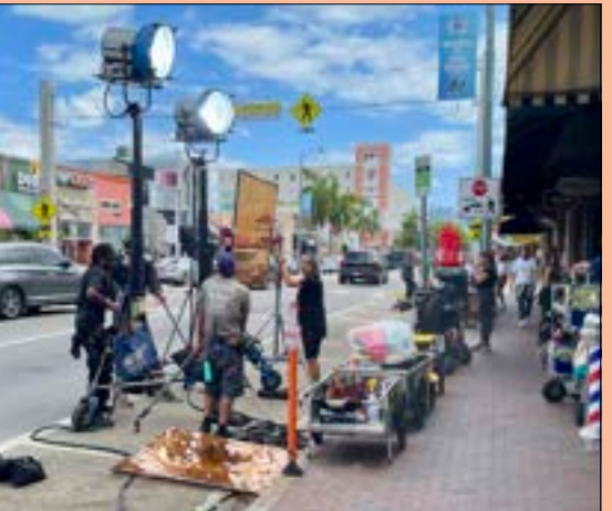
QUIET ON SET On the corner of a busy street in Little Havana, filming equipment is set up as scenes from a movie are being shot.

Because Miami is such a visually stunning loation, many movies have been filmed here. Notable movies that have been filmed in the Miami area include Ballers, CSI Miami, Bad Boys, Ace Ventura: Pet Detective and Fast and Furious