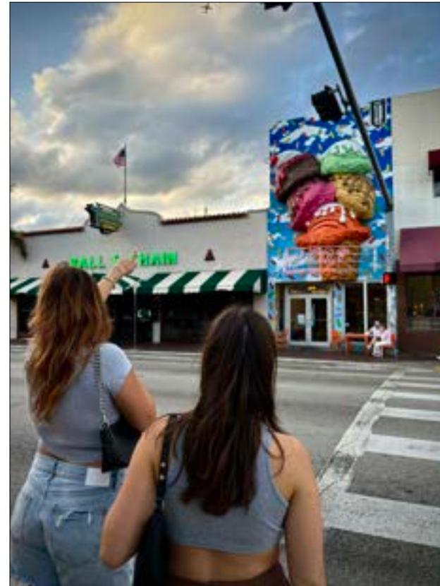
HISTORY WITHIN REACH Students spot the iconic Ball & Chain, a nightclub opened in the 1930s that has served as a gathering place for locals and visitors, steeped in Cuban culture and music, where they continue to offer live acts spanning from Latin Jazz to Salsa.

F rom pastel colonial-style buildings to Mediterranean bungalows and modern touches like Art Deco facades, the Little Havana neighborhood's diverse structures reflect its rich cultural tapestry. But it's the bustling streets, alive with markets and cafes, that truly capture the essence of Cuban heritage, creating a dynamic and immersive experience at the heart of Miami.