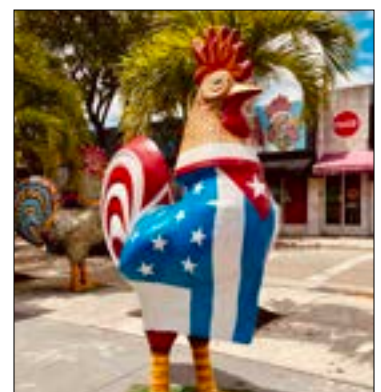
ANIMAL ARCHITECTURE While walking the streets, a large chicken statue is seen, adorned with the Cuban flag.