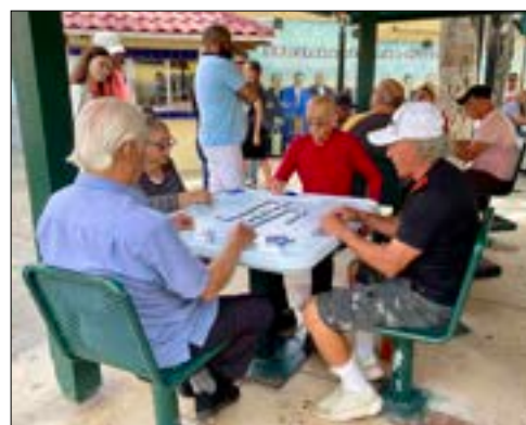
FUN GAMES All throughout Little Havana, large gatherings of people can be seen. They are playing the Cuban game of dominoes, and invite all those who walk by to partake.