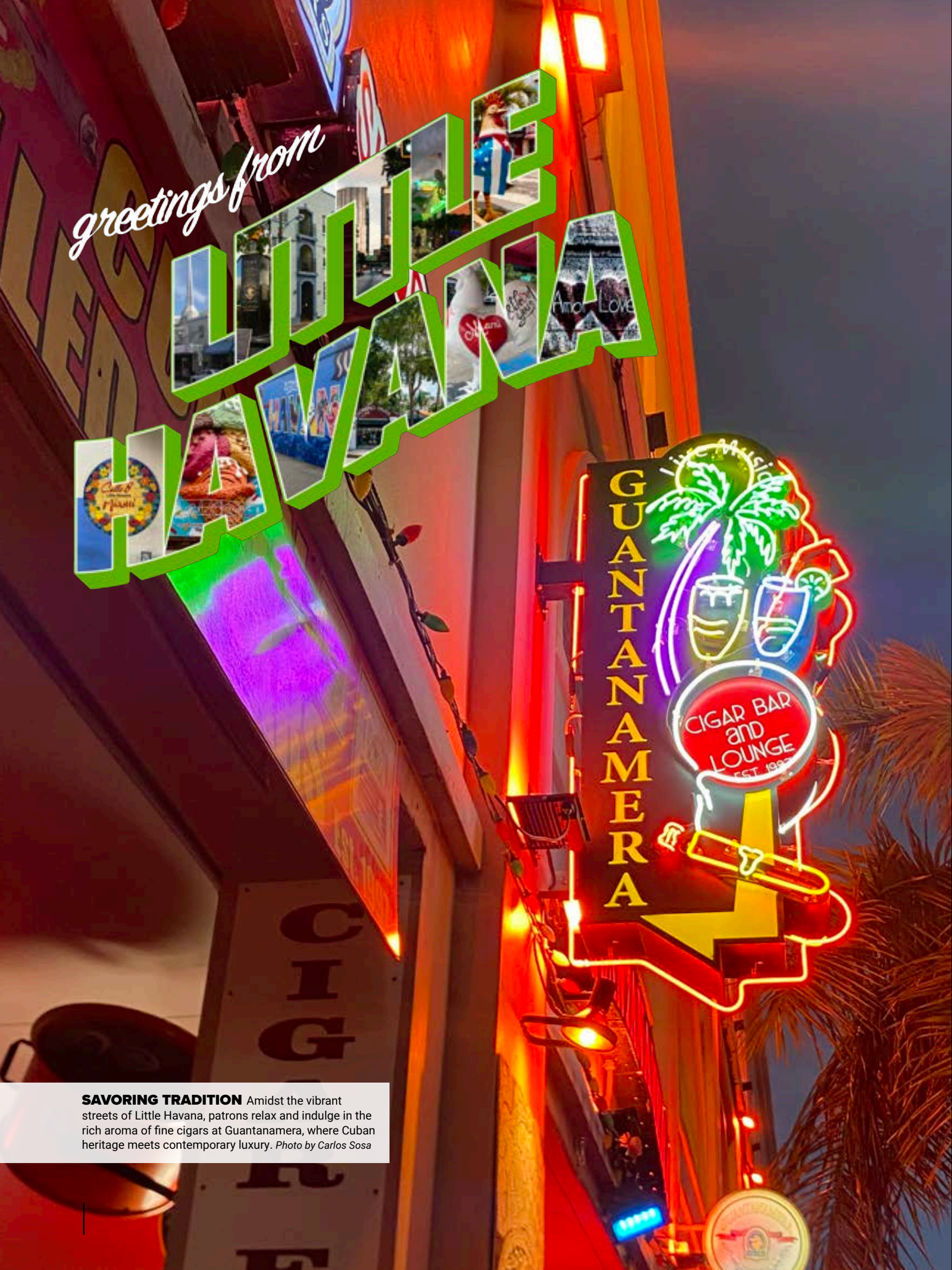
SAVORING TRADITION Amidst the vibrant streets of Little Havana, patrons relax and indulge in the rich aroma of fine cigars at Guantanamera, where Cuban heritage meets contemporary luxury.