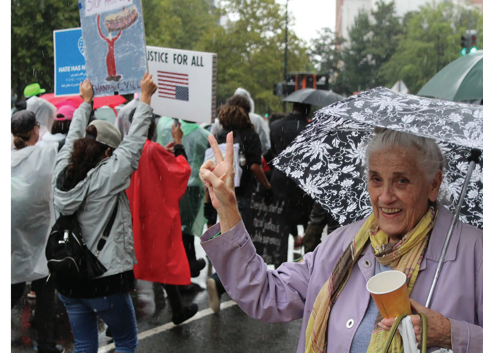
PEACE OUT — A woman shows her solidarity with the March to Confront White Supremacy amongst a group of protesters on the streets of Georgetown.

"This is probably something that's going to stick with the students and the faculty for a really long time,"