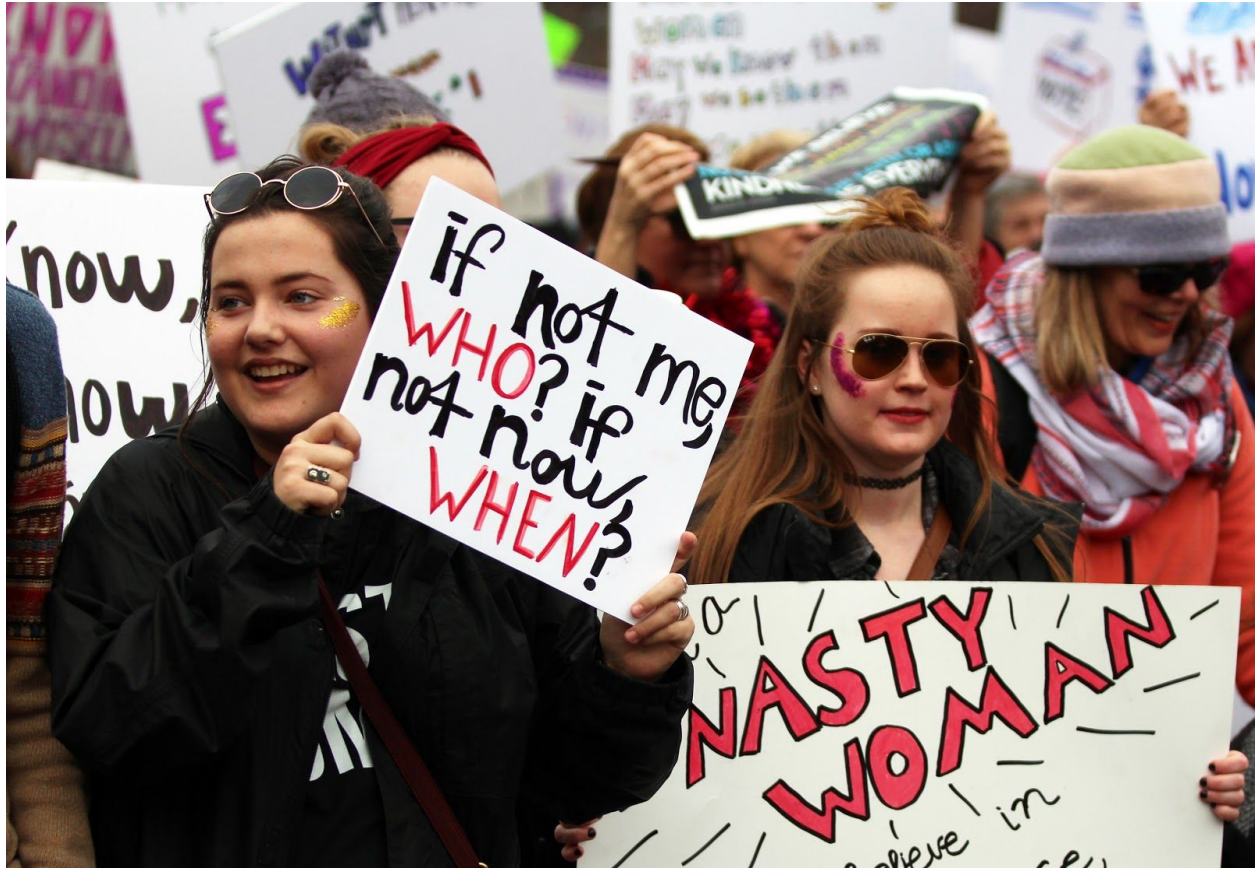
During the second Saint Louis Women's March on Jan. 20, two marchers carry homemade signs as they march down Market Street. Many of the signs at the march covered the recent #MeToo and Time's Up movements. Both issues cover the topic of the sexual assault and harassment of both men and women. They also covered other issues like global warming, wage gap, and America's involvement in foreign affairs.