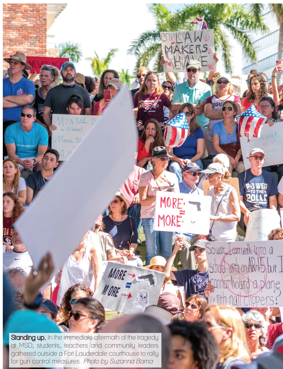
Standing up. In the immediate aftermath of the tragedy at MSD, students, teachers and community leaders gathered outside a Fort Lauderdale courthouse to rally for gun control measures.

Each of these reform movements, as well as the hundreds more that have taken place throughout America’s history, are focused on different issues and yet still use very similar methods in order to get their messages across. Similarly to the tactics used with the women’s suffrage and the abolition movement, many of them have come to work together to fight for their goals in unison, pooling their resources in order to achieve a more effective outcome. Today, many activist movements follow in