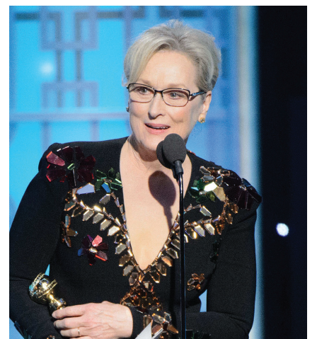
Meryl Streep accepts the Lifetime Achievement Award at the 74th Annual Golden Globe Awards at the Beverly Hotel Sunday on Jan. 8, 2017.

Regardless of whether or not one believes this discourse belongs in television or music, it has greatly affected children and adults watching everywhere. The monster this season on American Horror Story is the miscommunication between people on both sides of the