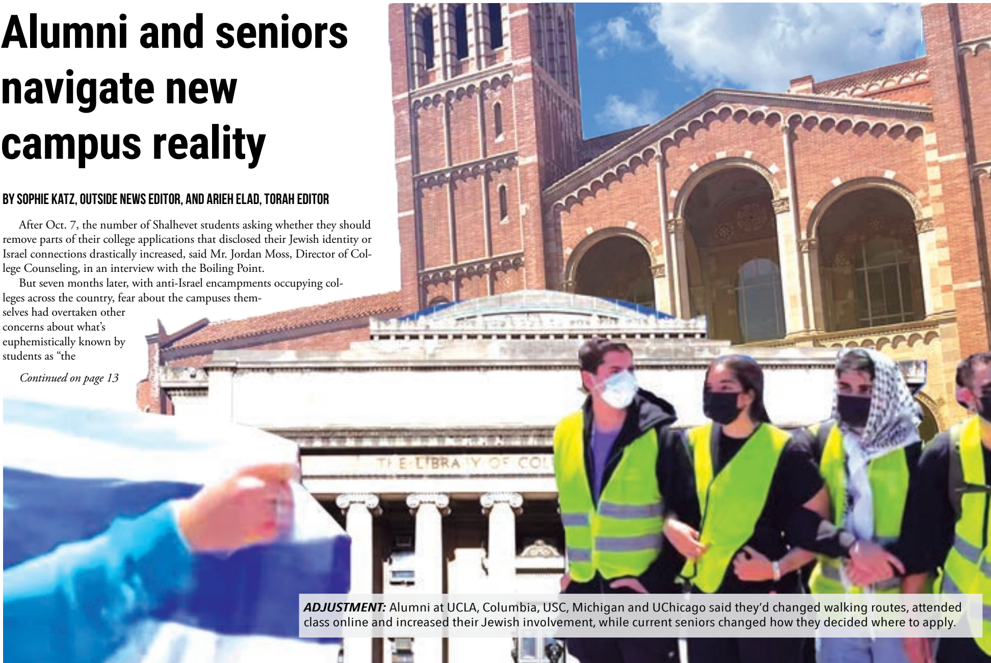
ADJUSTMENT: Alumni at UCLA, Columbia, USC, Michigan and UChicago said they'd changed walking routes, attended class online and increased their Jewish involvement, while current seniors changed how they decided where to apply.