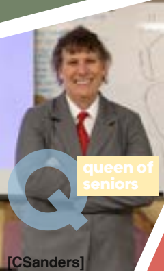
queen of seniors