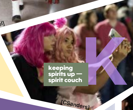
keeping spirits up — spirit couch