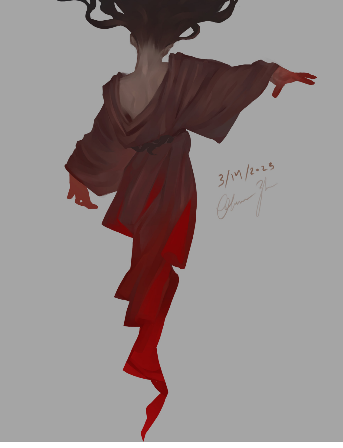
Tisiphone / Oliver Zhu digital art