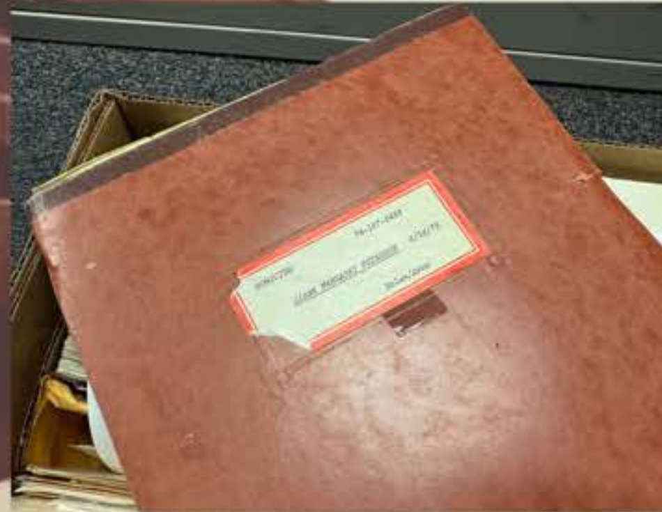
Original case folder and banker box from 1978