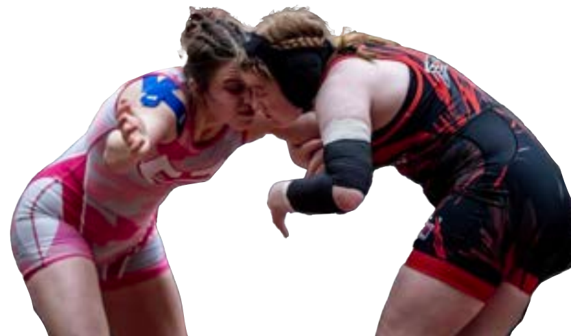
Former Cleveland wrestler competing through the Big Dawgs Mat Club for a wrestling tournament.

as something that is not true and something that appeals to misandry more than any-