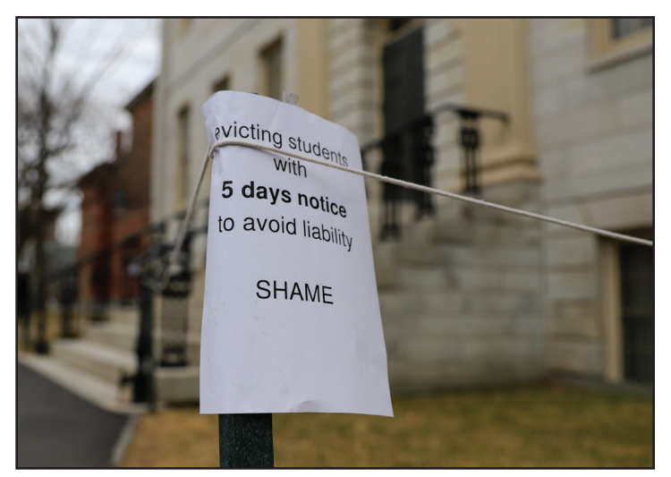
Harvard College students were notified to vacate their houses and dorms by March 15, five days away.