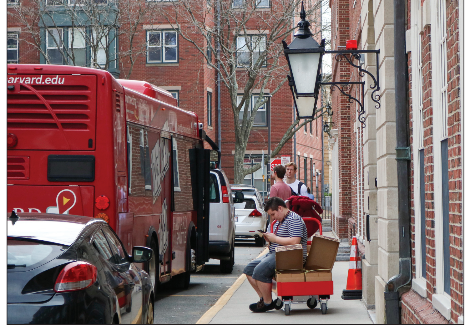
On Tuesday morning, Harvard University announced the upcoming transition to virtual instruction for graduate and undergraduate classes. A student waits with his belongings in preparation for vacating campus outside of Leverett House Tuesday morning.