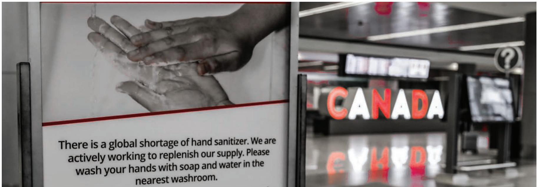
Global shortage of sanitary essentials leave many at risk.