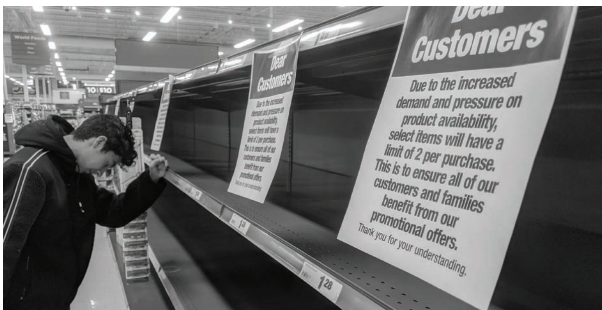
Shortage of items leaves frustration in shopper.

While on the road, big signs warning people to wash their hands were lit up. Signs thanking public servants could also be seen. The traffic was light yet the sky was beautiful as the sun started to set.