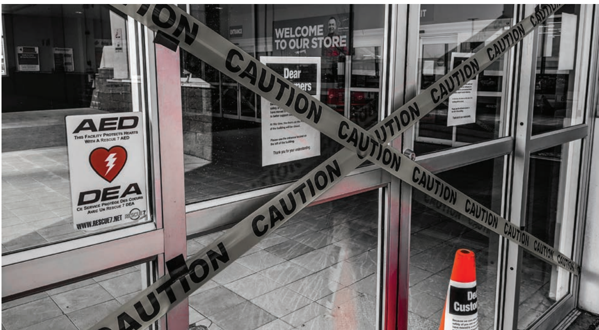
Doors at stores are closed to control traffic.