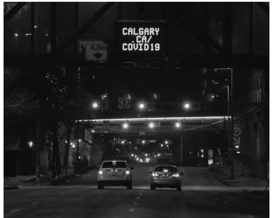
Road signs warn people of the importance of cleanliness.