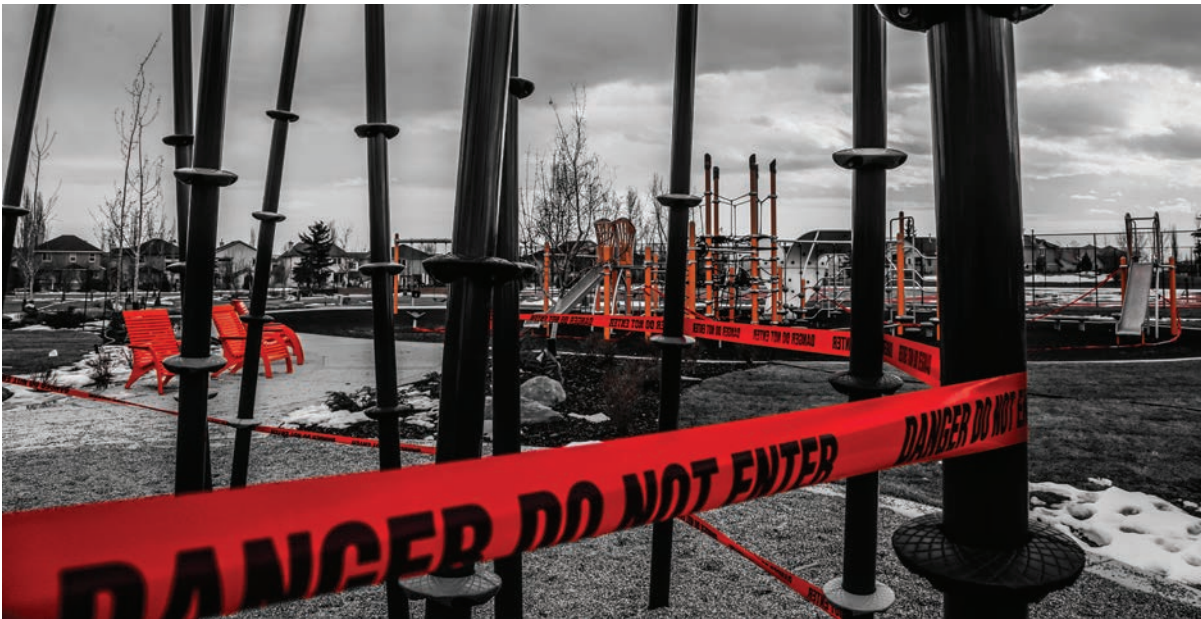
Playgrounds closed off to prevent the spread of the virus.

As I walked up to the store I saw one entrance was closed off, the carts were all outside and the majority of people were wearing gloves and masks. I headed to the toiletries aisle and indeed there was no sanitizer. I walked around and could not find toilet paper nor canned foods. I kept imagining mobs in my head. I used the grocery store's washroom to clean my hands and continued my field trip. I stopped by another grocery store and their inventory was just as sparse as the first one. I did, however, find some really nice signs on the floor to aid in the physical distancing. The hospital was my next stop but I was not willing to go inside. Nothing seemed out of the ordinary. Next to the hospital is an elderly living facility. The home was closed off to all visitors, with signs placed around the parking lot to warn them off.