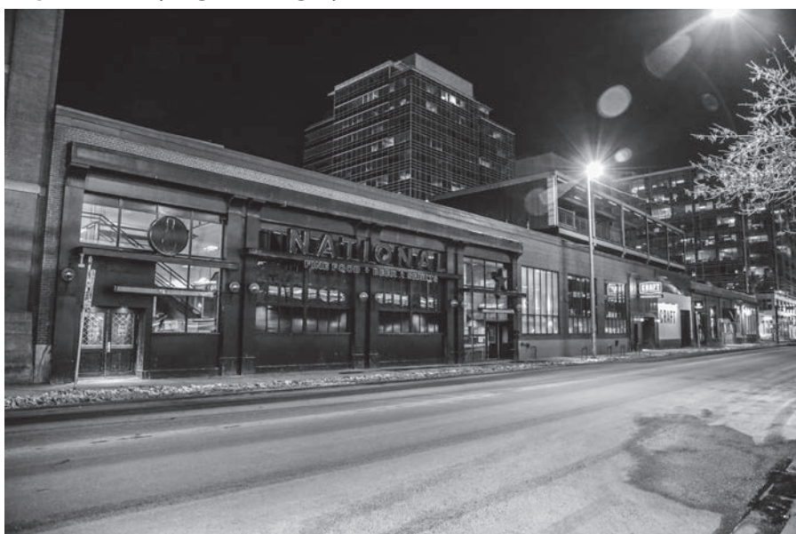
Calgary's normally busy 10th Ave. is empty throughout the weekend.