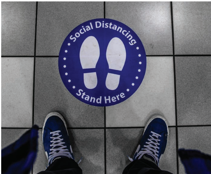
Signs guide people to assist in physical distancing.