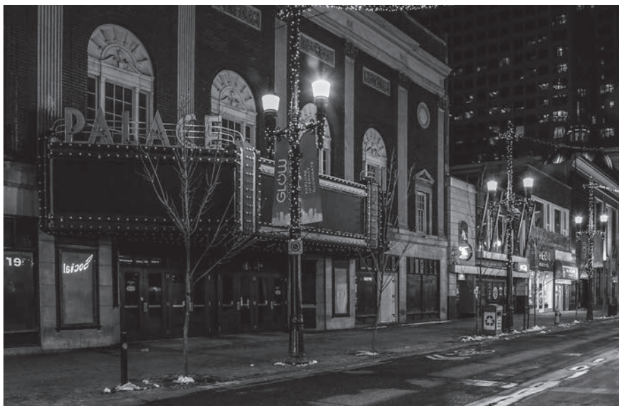
10 pm Saturday night in Calgary Downtown.