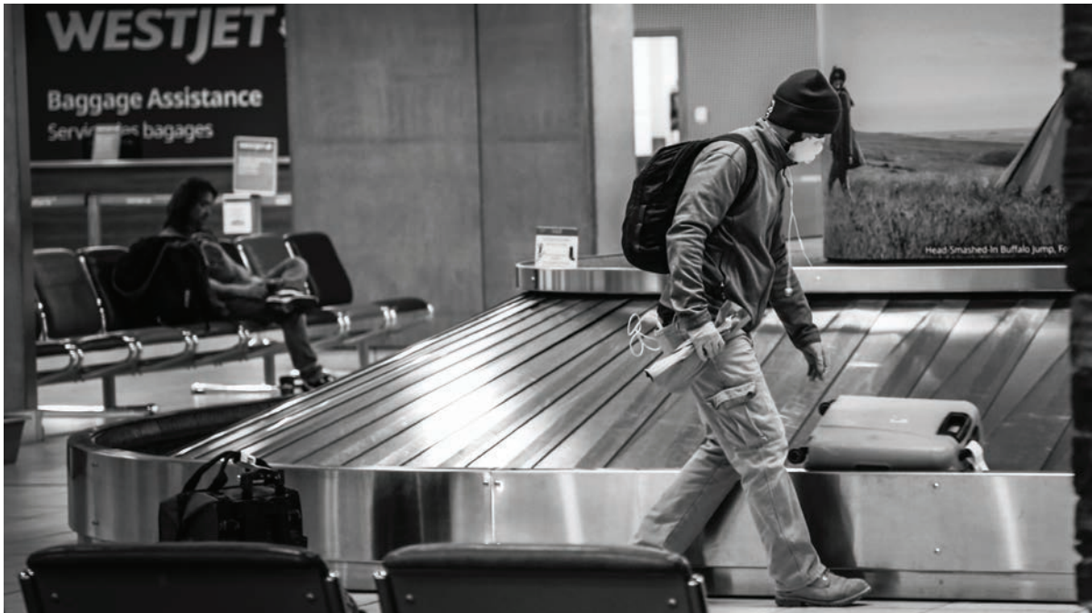
Man collects his baggage at airport while wearing mask and gloves.

As I walked up to the store I saw one entrance was closed off, the carts were all outside and the majority of people were wearing gloves and masks. I headed to the toiletries aisle and indeed there was no sanitizer. I walked around and could not find toilet paper nor canned foods. I kept imagining mobs in my head. I used the grocery store's washroom to clean my hands and continued my field trip. I stopped by another grocery store and their inventory was just as sparse as the first one. I did, however, find some really nice signs on the floor to aid in the physical distancing. The hospital was my next stop but I was not willing to go inside. Nothing seemed out of the ordinary. Next to the hospital is an elderly living facility. The home was closed off to all visitors, with signs placed around the parking lot to warn them off.