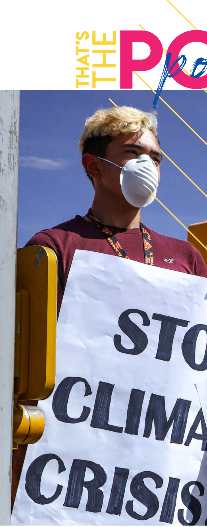
THE LEGEND 2020 • Volume 17 • 12401 Edgemere Blvd., El Paso, Texas 79938 www.aztecgold.net @ @edhyearbook ¥ @edhsb112 • www.sisd.net/eldoradohs 2-5A • 2,083 students • 141 Faculty