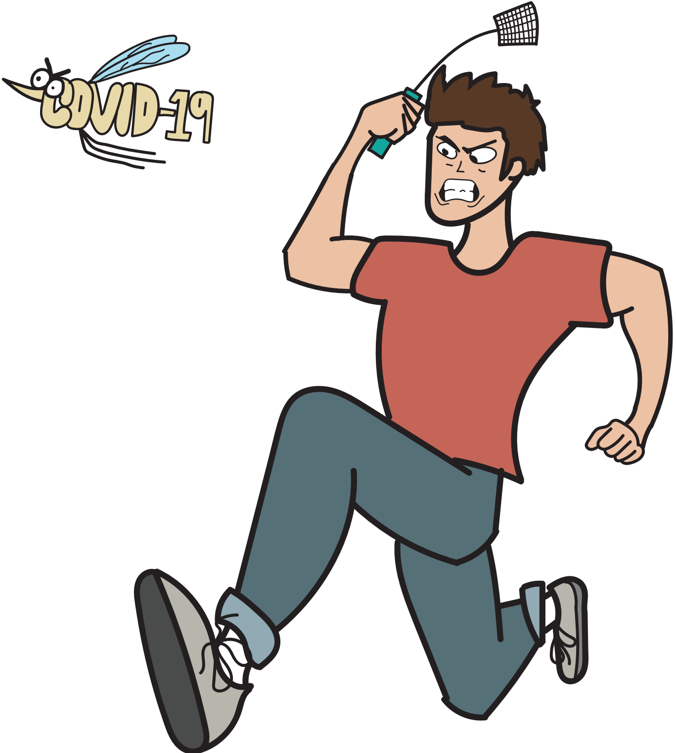
Illustration of our senior Co-Editor and Chief of online, swatting at COVID. Used in our senior issue, that was mailed to all attending students at Lawrence High School. The Idea of a COVID mosquito was inspired by kids TV show, Word World.