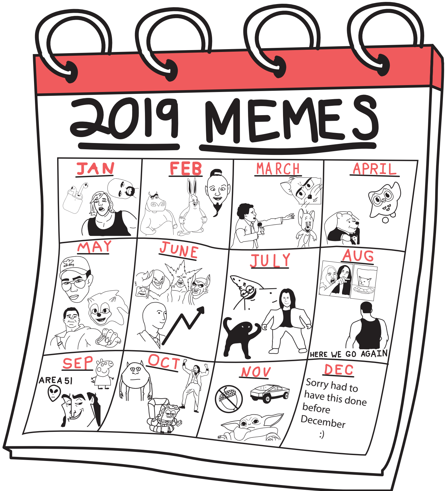
Illustration of the 2019 Memes for the comic of the December issue. It encompasses the most popular meme during the months of 2019.