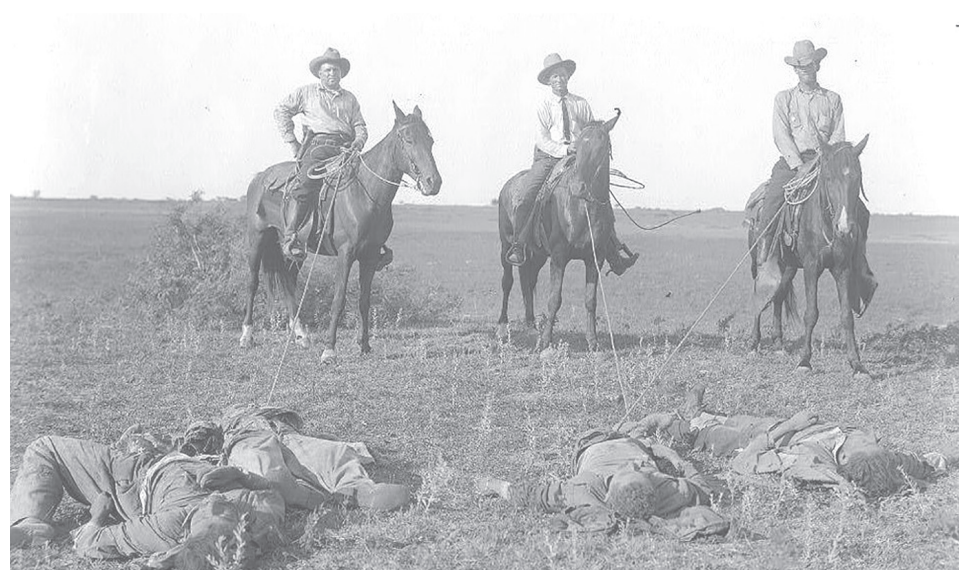
MURDER AT LA MATANZA – Historians say Texas Rangers killed hundreds, possibly thousands, of Mexicans and Tejanos in South Texas from 1915-19, calling the victims "bandits." They were actually legal landowners, ranchers, farmworkers or Latino Texans traveling in their home state. This photo was taken in October 1915 by Texas Rangers proud of their work.