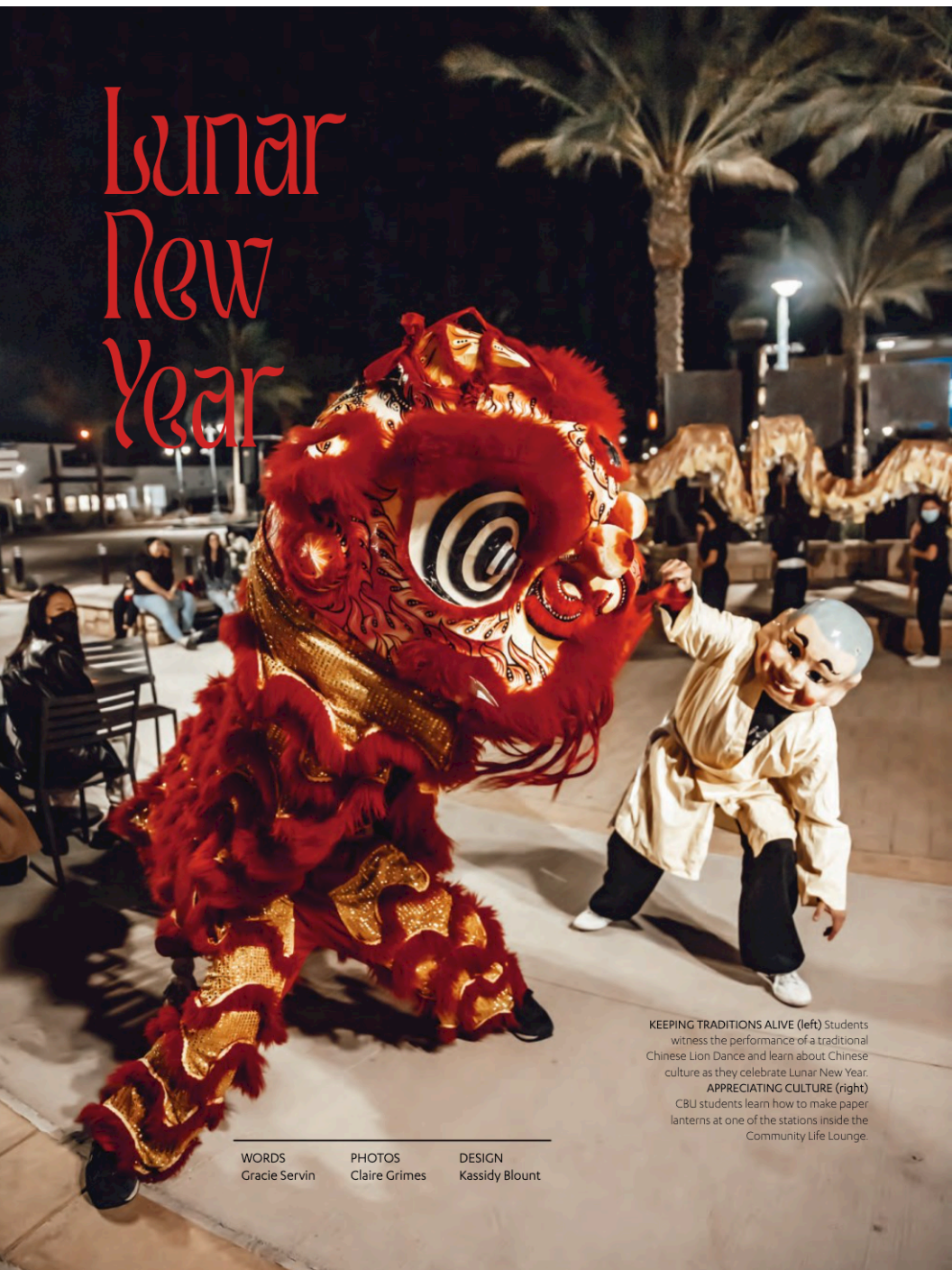
KEEPING TRADITIONS ALIVE (left) Students witness the performance of a traditional Chinese Lion Dance and learn about Chinese culture as they celebrate Lunar New Year. APPRECIATING CULTURE (right) CBU students learn how to make paper lanterns at one of the stations inside the Community Life Lounge.