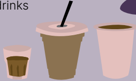
ESPRESSO LATTE AMERICANO