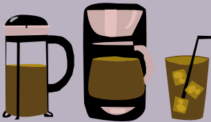
French Press 80-135 mg Drip Coffee 175 mg Cold Brew 155 mg

Caffeine levels in drinks per 8 ounce serving