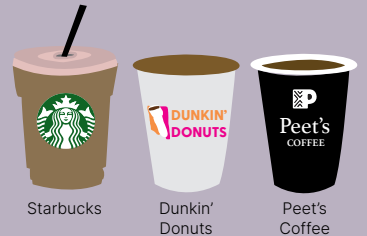
Starbucks Dunkin' Donuts Peet's Coffee

Three of the most popular coffee chains in the U.S.