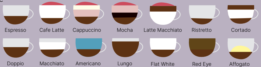
illustration by | MARISSA MATHIESON