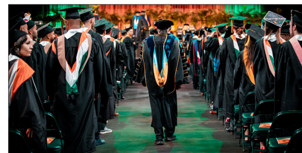
WALKING DOWN Faculty and staff, as well as President Julio Frenk, walk down the center of the graduates before taking the stage for pre-ceremony speeches.