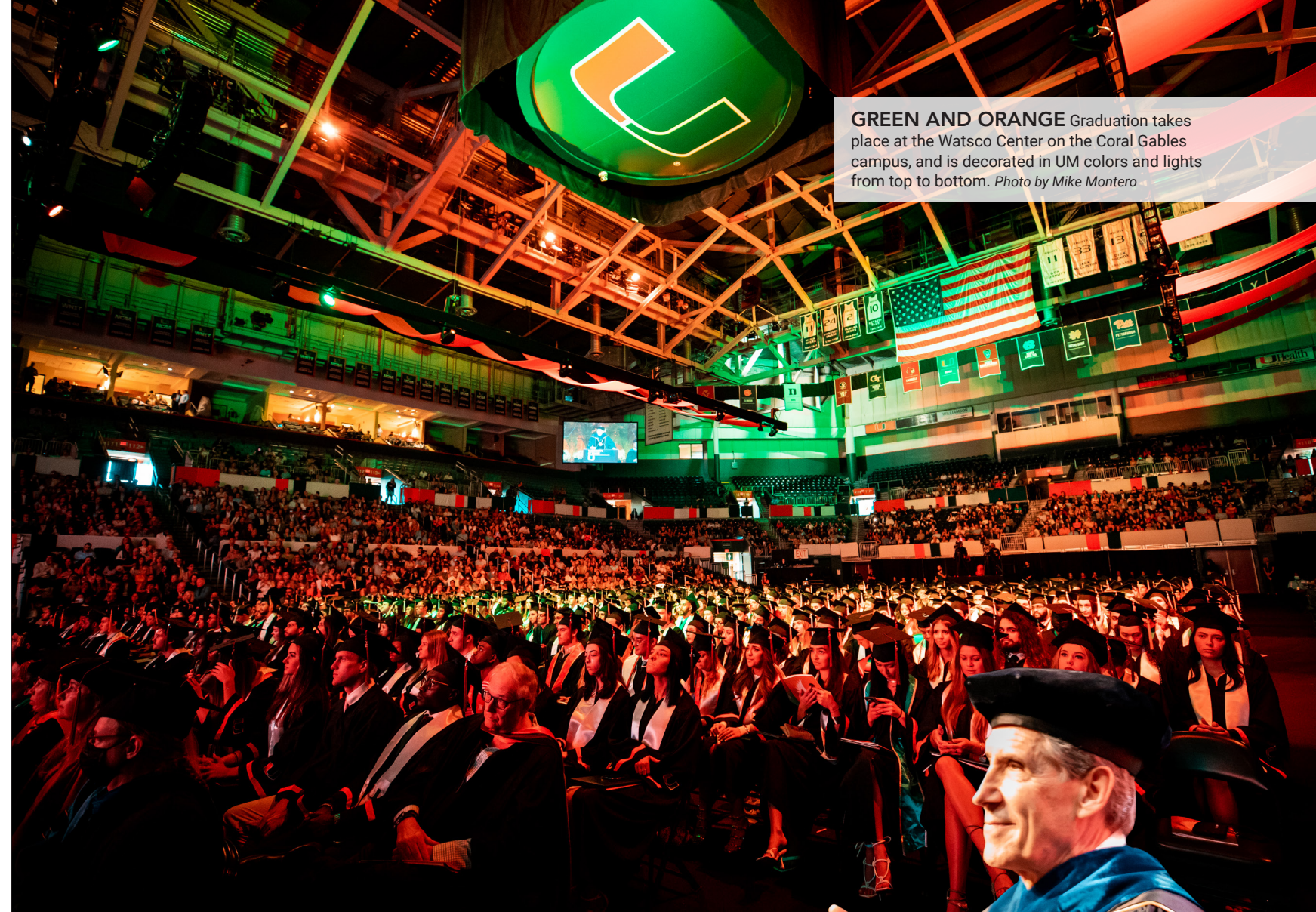
GREEN AND ORANGE Graduation takes place at the Watsco Center on the Coral Gables campus, and is decorated in UM colors and lights from top to bottom.