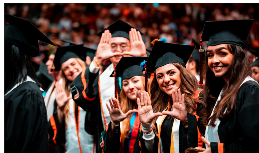
NEW GRADS Students from the School of Communication celebrate their new Alumni status by throwing up the 'U' together for one last time.