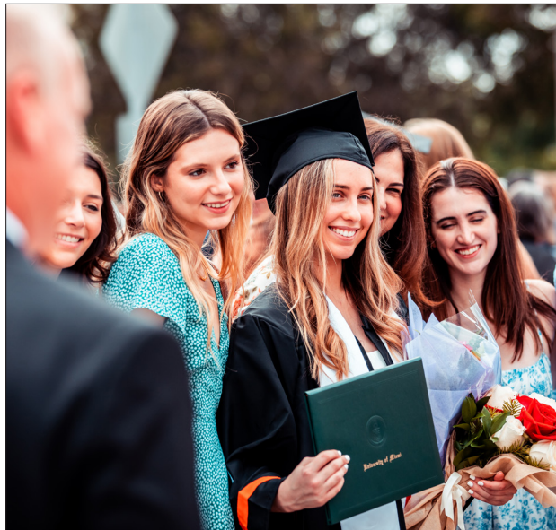
MY FAMILY Family members of graduating 'Canes flock to Miami to celebrate the graduation of their students at the Watsco Center.