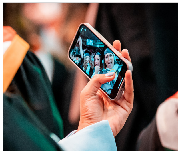
SAY CHEESE Selfies and videos are taken on Snapchat to commemorate the special moment.