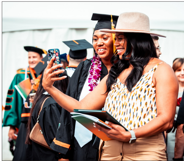
FAMILY LOVE After the formal graduation ceremony, students celebrate their accomplishments with all of their family and friends who attended the ceremony.